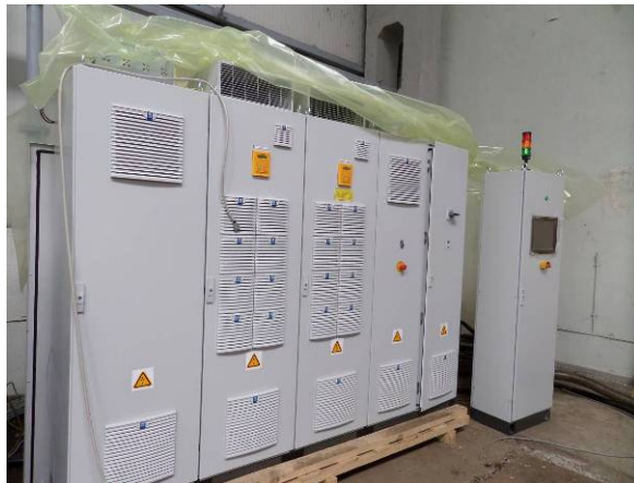
Power Cabinets and Control Cabinet

The Power Electronics Cabinets contain the Converter and all electrical facilities and are used to transfer power between the AC input and the Electric Motor in a controlled manner. The power cabinets work in the four quadrants.