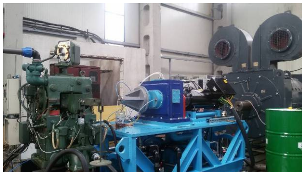
No load test configuration

The STARTGENSYS Test Bench has been factory tested between February and September 2015. The first tests have shown that the electric motor, with no load, is able to reach the maximum speed in both senses of rotation and the Power Cabinets and Control Cabinet work together as designed. Next in the testing process, the gearbox has been integrated in the test bench and tested, without load, up to 27000 RPM for 8 hours in each sense of rotation. When the full test configuration pictured above has been set, a series of load tests has been started. These tests were performed in several stages, with progressively increased speed and torque: 21800 RPM @ 8.5 Nm, 23700 RPM @ 30 Nm, 27000 RPM @ 7.2 Nm.