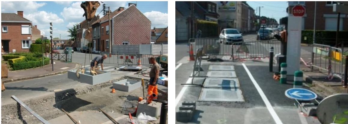
Figure 5 & 6 – Ongoing installation work and view of the finalized installation

Dynamic charging station's equipment's, with primary plates, were implemented in respect to an execution plan. Infrastructures works were done in the same time, with pipes and electrical connections (power cables of the coils, thermal protection and magnetic sensor). All the work done has allowed to perform all the needed conformance and performance tests under real usage conditions, as well as the demonstration of the project result during an Open Day.