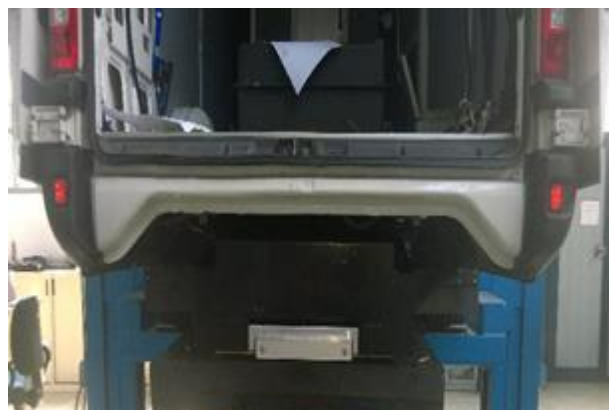
Figure 7 – Installation of the black box on the vehicle's chassis

The whole system is assembled and fixed at the rear end of vehicle chassis and works as a carrier of the secondary coil. It also contains other components such as the AC/DC module. The final system was tested before demonstration activities in order to ensure the compliance with the requirements and to avoid any kind of functional problem during operation in a real urban context by performing matching tests, static tests, dynamic tests, durability tests, field tests and EMC tests.