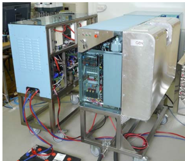
Figure: development phases of the FCGEN APU and brief sketch of partner roles in the project