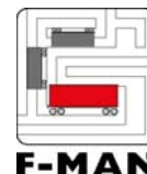
Table 2 – Companies joining the Railway Operators Group