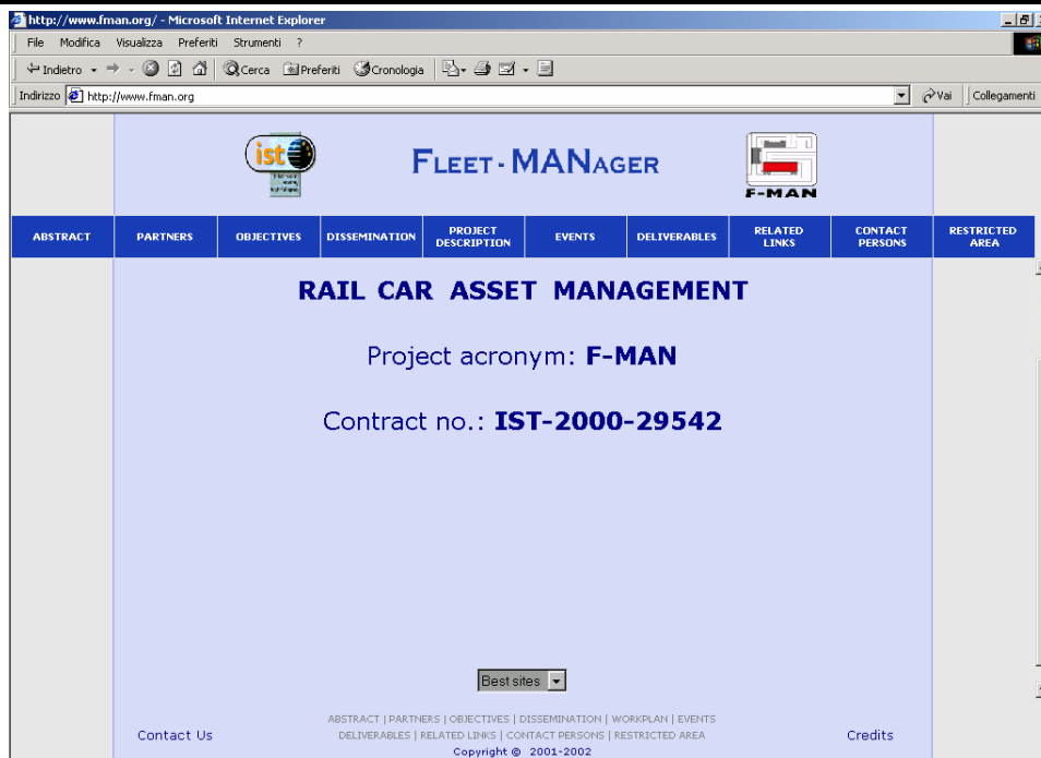
Figure 2 – Main page of the F-MAN Web site