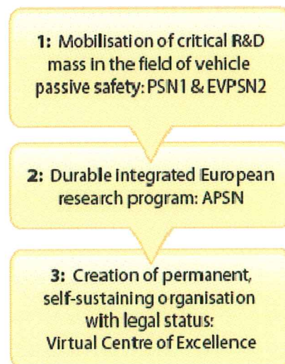
Figure 1 Development of APSN

APSN followed in the footsteps of two previous EU thematic networks on vehicle passive safety: PSN and EVPSN2. In contrast with its predecessor this Network of Excellence (NoE) specifically aimed at establishing a durable integrated European vehicle passive safety research and implementation program and the creation of a Virtual Centre of Excellence (VCE). This was to be realised by the creation of a permanent form of organisation in order to continue the activities among the partners started under the umbrella of the EU funded Network of Excellence and moreover do this in a self-sustainable way (see figure 1)