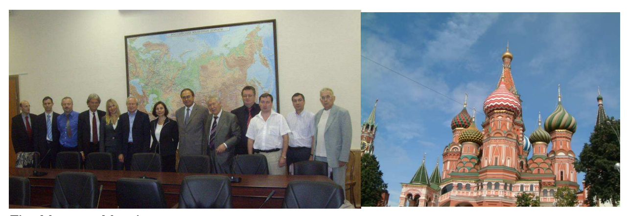
Fig. Moscow Meeting

Two International conferences were organised by the Moscow State University of Railway Engineering (MIIT). The first conference took place on August 27/28, 2009 and the second one within a National Information Day with EC on September 23, 2009 at Petersburg State University of Transport (St. Petersburg).