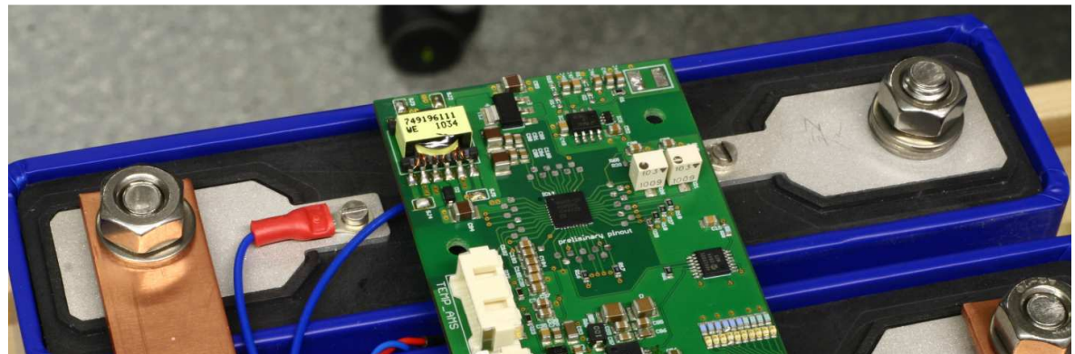
Example of Battery Monitoring IC from autriamicrosystems (AS8505) evaluated by Fraunhofer IISB in the E3Car project

Some of the major results of ESTRELIA project will lead to energy efficiency and extended driving range of the FEVs and this will mitigated constrains for the user of the FEV versus the Internal Combustion Engine vehicle. By the end of the day this will bring FEV closer to the end user and ensure a wide expectance.