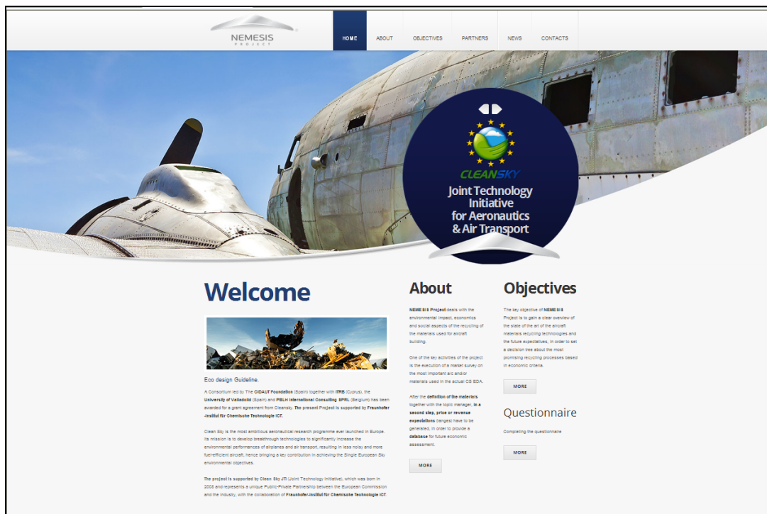
Fig. 5 Screenshot of the homepage of the website

Additionally, the activities and first developments of the project were disseminated through CIDAUT Newsletter, an online publication reaching over 1,000 recipients from fields ranging from the corporate, research and public sectors with whom CIDAUT has previously collaborated.