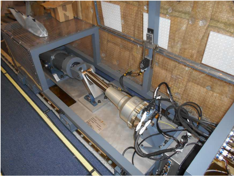
Image 1. ARMLIGHT EMA actuator performing tests at ATR aircraft flight demonstrator