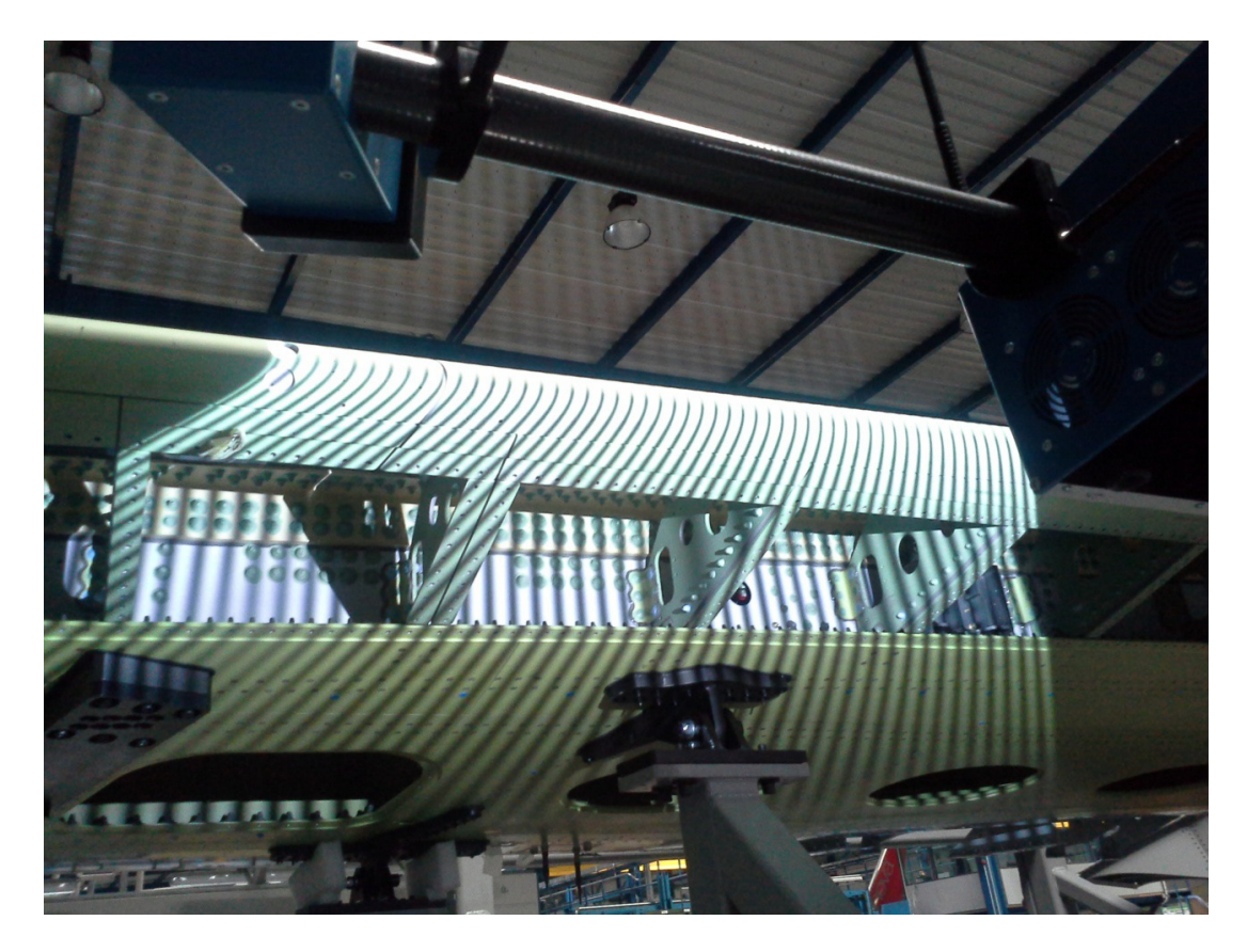
Figure 2: Fringe-projection measuring procedure applied to the BLADE GKN wing (front nose section & lower cover)

Figure 1: New measurement setup introducing a third camera in the middle of the two existing cameras. The additional camera is located above the projector. Benefits: The measurement volume will be extended and the uncertainty will be improved while solving the problem of specular reflection of a glossy finish at once.