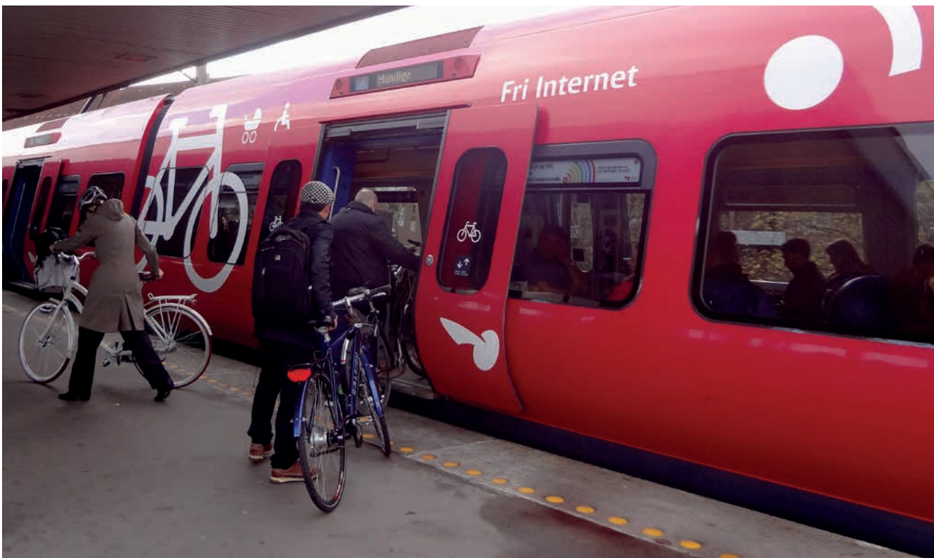
Reference: Embarq Sustainable Urban Mobility by WRI

Transport directly affects all of Europe's citizens. Personal mobility and the movement of goods enable and enhance our quality of life and contribute to the EU's economic prosperity. Promoting efficient, safe, secure and environmentally-friendly transport is an aspiration for most stakeholders in Europe.